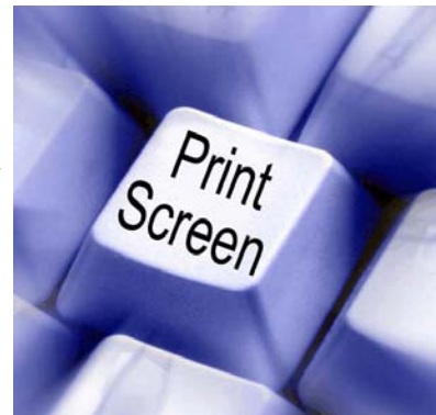
Figure 1 Your key may be called "PntScn" or "Prnt Scrn"