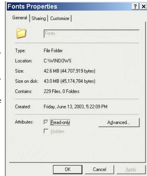
Figure 2 — AFTER 229 fonts; 43.0 Mb

NOTE: You may not have all the required fonts if you do not have programs associated with them.