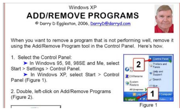
Figure 3 Fit Visible Actual width of screen.