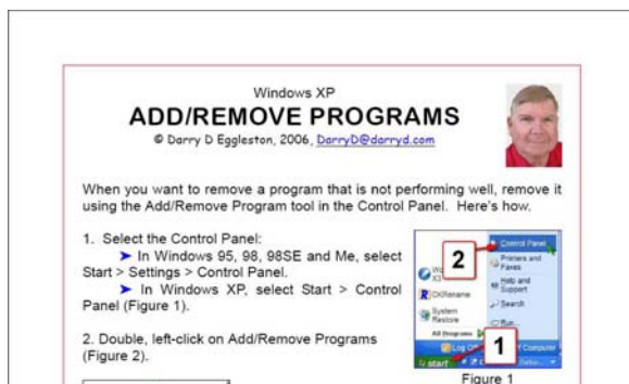
Figure 2 Default View Actual width of screen.

3-5. Open any document and your eyes will appreciate the difference in the view. (See Figures 2 & 3.)