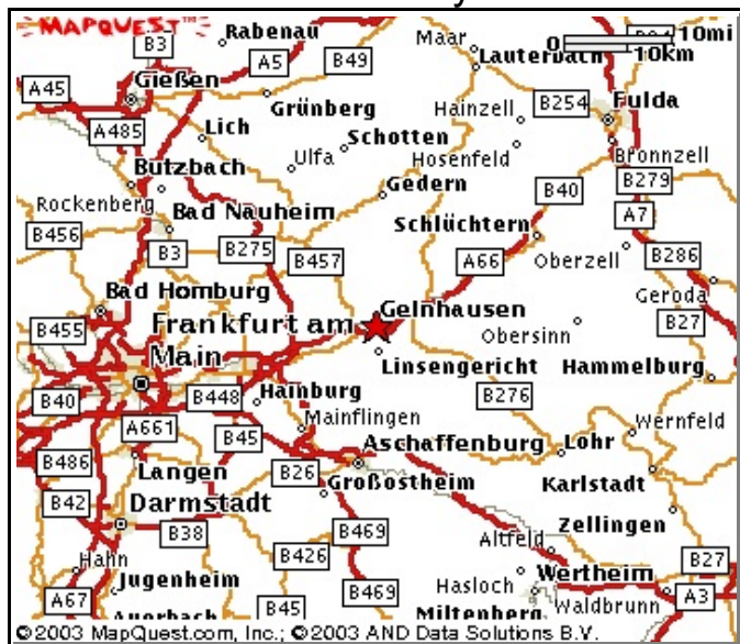
Figure 1 — Gelnhausen , Germany, about 27 miles north-northeast of Frankfurt am Main

Even as I rose in the ranks to become a sergeant, I was always disappointed in the way we were treated by our superiors. It was as if we had little or no sense — or value. They seemed to be enamored with the motto, " To seem rather than to be. "