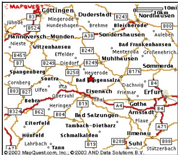
Figure 2 — Hoenfeld

I would wear it proudly for 12 years, but that’s another story for another time.