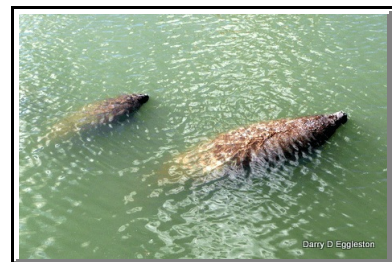
Mom Manatee & Calf

DIRECTIONS: Take the Causeway to US 41 South, and turn right at Big Bend Road, The center is ¼ mile on the right.