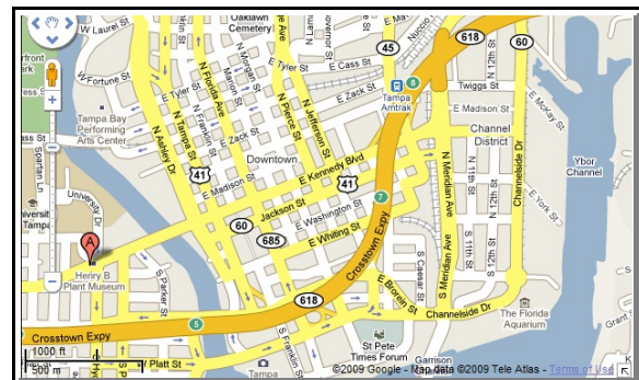
Map to Plant Museum