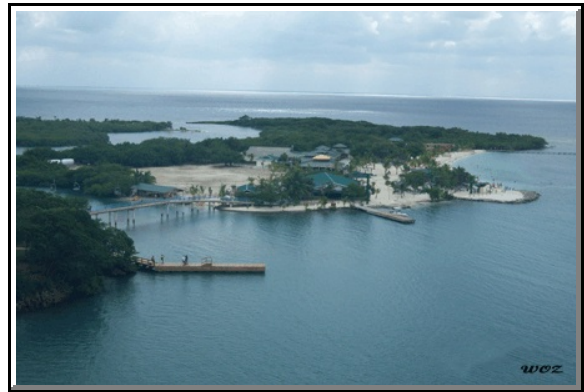
Mahogany Beach Dec/18/09

► MasterBaker, Jul/13/2010: Our reason for taking a tour in Roatan is simple. Snorkeling. Mahogany Beach is man made, although it is pretty it doesn't have a reef. I think it's great that Carnival has made that beach though. Many people don't like to venture out far from the pier area and Mahogany offers them a beautiful place to relax and enjoy a nice day ashore.