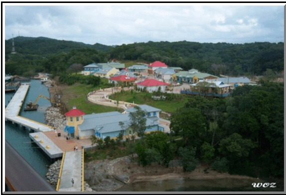
Shopping Mall Dec/18/09

► MischievousSmile, Jul/13/2010: I hope to get to see Mahogany Beach this time. When we were there in April, the ship was unable to dock there because of the winds expected later in the day. (The week before the ship did and couldn't get out so they missed the next day's port.) So we went to Coxen Hole and tendered in. Friends and I rented a car for the day so tried to go to Mahogany Beach, but were unable to do so as the entire thing is closed with just security there on the days that ships cannot dock there. I've been told this happens often and can't help but wonder if the Dream won't have an issue because it is so big.